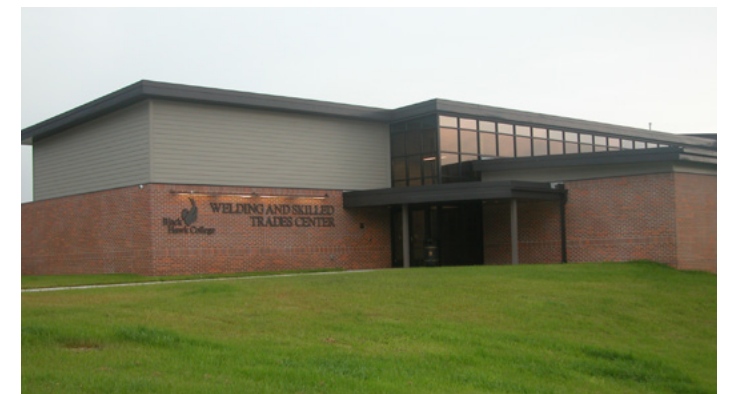
The Black Hawk College Welding and Skilled Trades Center is located across the parking lot from the Black Hawk College Community Education Center in Kewanee, IL.

The Bureau of Labor Statistics (BLS) reports that welders have a bright job outlook in coming years, projecting a 15 percent growth rate in the number of welder positions through 2020, slightly higher than the average for all occupations. The BLS estimates that an additional 50,000 welding positions will be added during the decade.