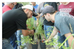
L to R: Students packaging food for area families; BHC East Campus students preparing arena for livestock judging competition; students practicing plant identification for crop contest.